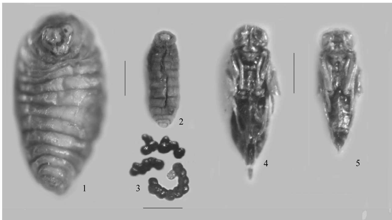
Fig. 1-5: Eurytoma sp. ( rosae group): (1) last instar larva; Puklina asphodelinae : (2) last instar larva; (3) meconium; (4) pupa, ♀; (5) pupa, ♂. Scale: 0.5 mm.