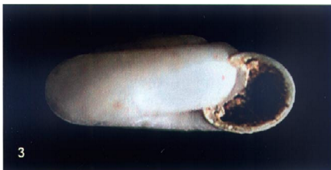
Figs 1–3. Vitrea vereae n. sp., holotype: 1 – top view (23×), 2 – umbilical view (23×), 3 – front view (22.5×); photo J. STOILOV

angle. The aperture is crescentic and flattened from below. The underside of the shell is slightly convex. The umbilicus is wide and perspective, of ca. 1/3 shell width, with all the whorls visible inside.