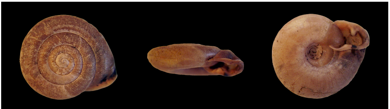
Fig. 2. Shell of the specimen of Soosia diodonta (Férussac, 1821) found on 13 Sep 2007.