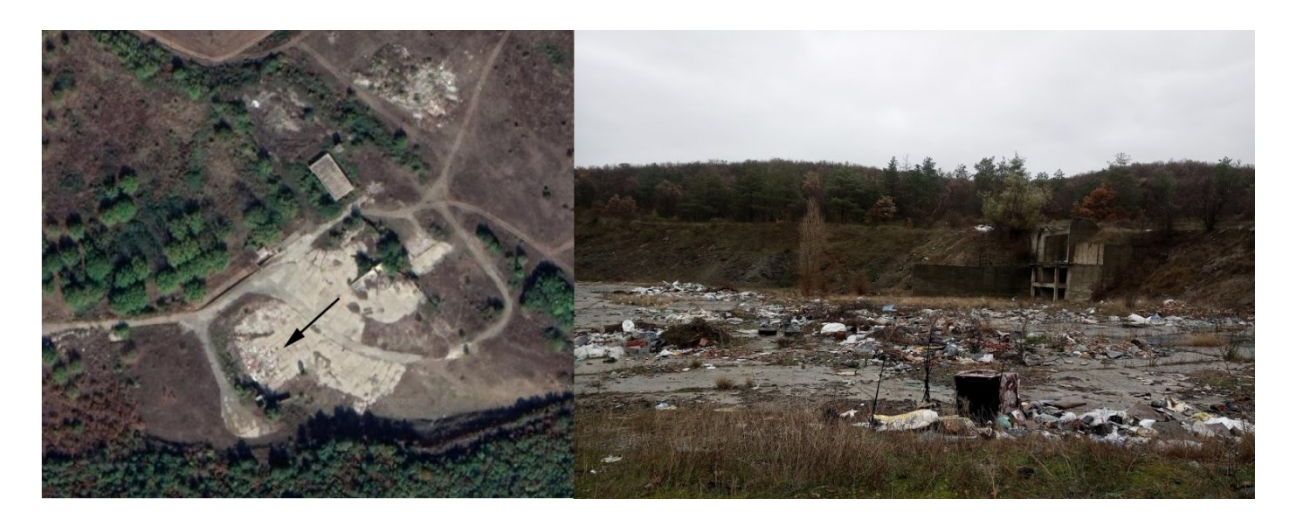
Fig. 2. Position of the largest illegal dump at the area, near the Medven Hill. Left - modified Google Earth satellite image, the object is pointed by an arrow, right - view from the dump site.

A total of 23 individual illegal dumps were located at the 5x5 km sample area around the villages of Hrishteni and Kolena. About \frac{1}{4} of them were situated near the Medven Hill, bordering with some agricultural lands. Their surface area can be spotted even on satellite images (Fig. 2, 3).