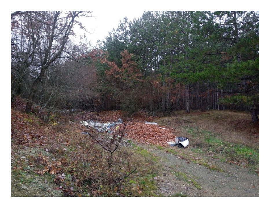
Fig. 4. A dump site in the forest, NE of the wall of Kilena Dam.