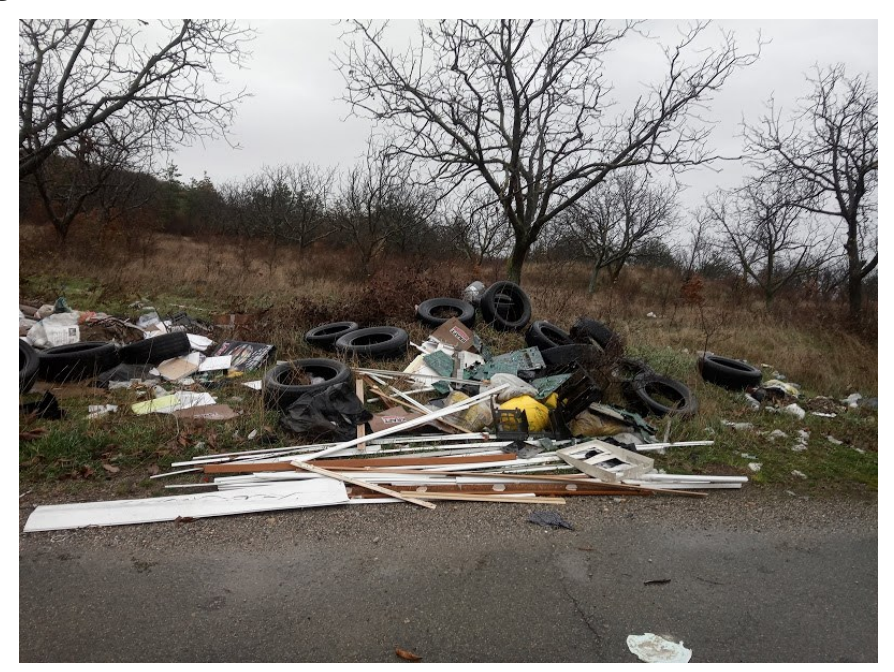
Fig. 3. A small dump site near the largest one at the area of Medven Hill.

Even the studied area is small it represents the real situation not only in the region of Sarnena Gora, but in the whole country. Many illegal dumps are now an integral part of the landscape. Even travelers on Bulgaria's main roads and highways can observe piles of dumped construction and household waste. Garbage is dumped even in city parks, canals, rivers and dams. Some of the illegal dumps are so large that they can be seen on Google satellite images.