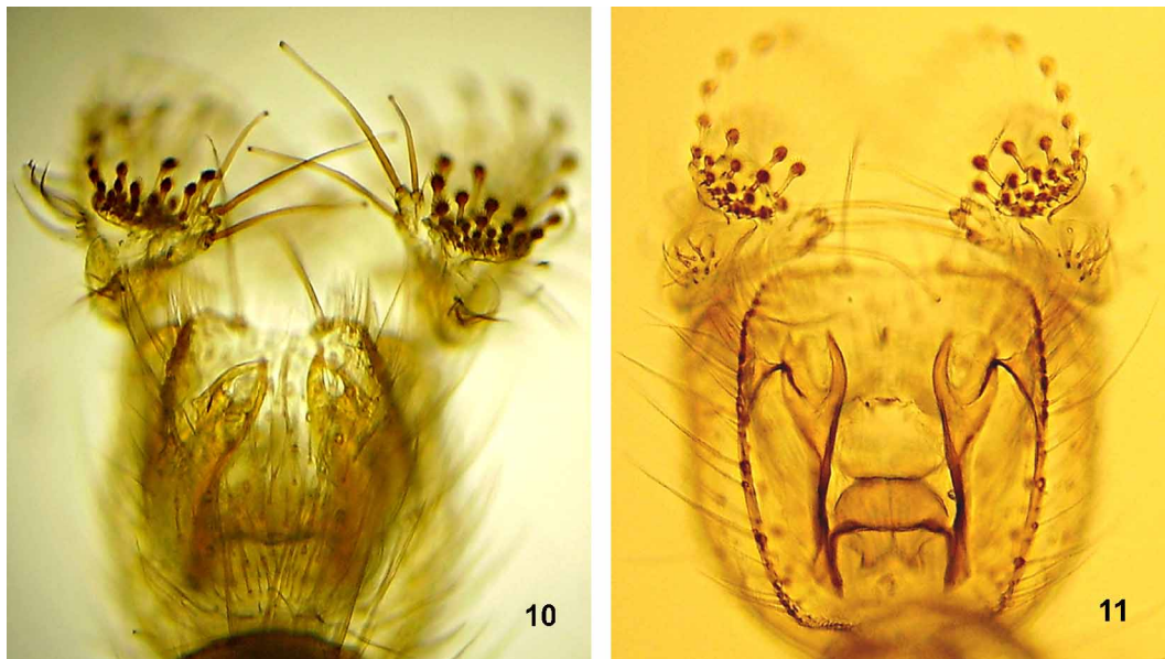
FIGURES 10–11. Male genitalia, dorsal view. 10. Sciophila muglolutea sp. n. 11. S. turkolutea sp. n.

Differential diagnosis. Sciophila delphis has apodemal processes different in form, but in S. turkolutea the outer process is long and bifurcate apically, whereas in S. delphis it is broad.